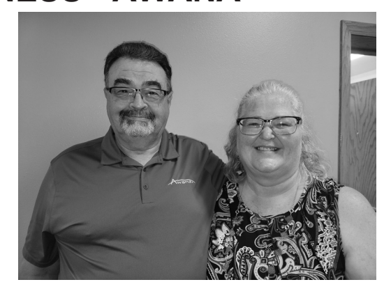
August 13, 2023